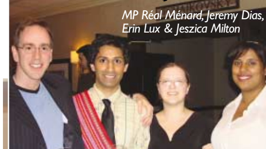
Jer's Vision team & the AlloStar Jury