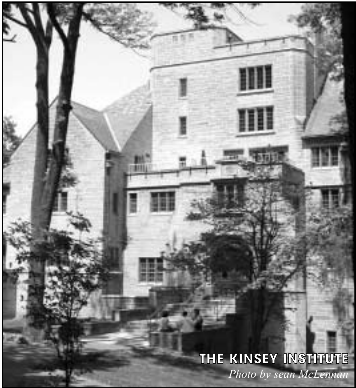
THE KINSEY INSTITUTE